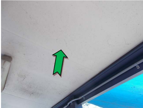
Photo 1. Exterior, west elevation, awning – suspected non asbestos-containing fibre cement sheeting.