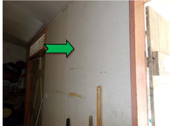
Photo 2. Interior, west elevation, wall – non asbestos-containing fibre cement sheeting.