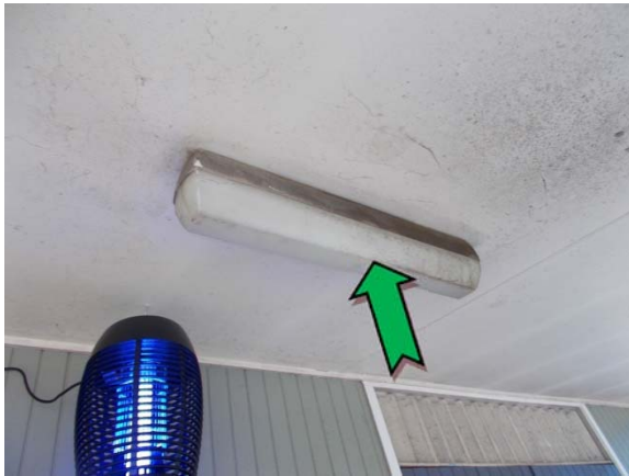
Photo 3. Exterior, throughout, single tubed fluorescent light fitting – suspected non PCB-containing capacitors.