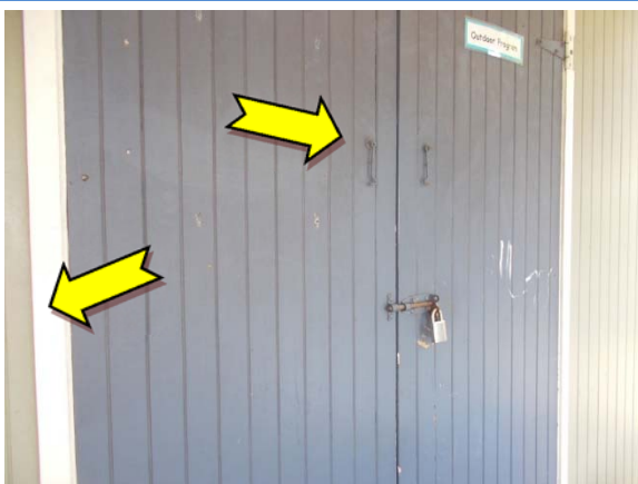
Photo 5. Exterior, throughout, doors – suspected lead-containing white and blue upper coloured paint systems.